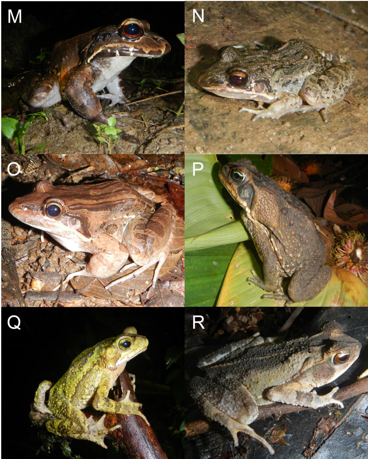
(M) Leptodactylus pentadactylus ; (N) Leptodactylus fragilis ; (O) Leptodactylus bolivianus ; (P) Rhinella marina ; (Q) Incilius coniferus ; (R) Incilius aucoinae