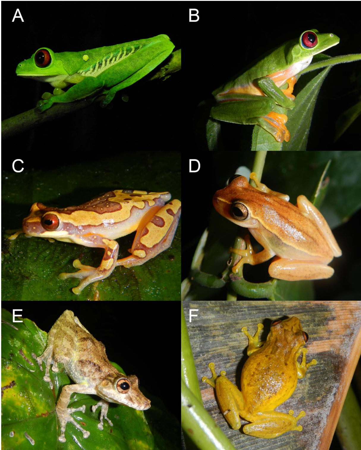
(A) Agalychnis callidryas ; (B) Agalychnis spurrelli ; (C) Dendropsophus ebraccatus ; (D) Dendropsophus microcephalus ; (E) Scinax boulengeri ; (F) Scinax elaeochroa