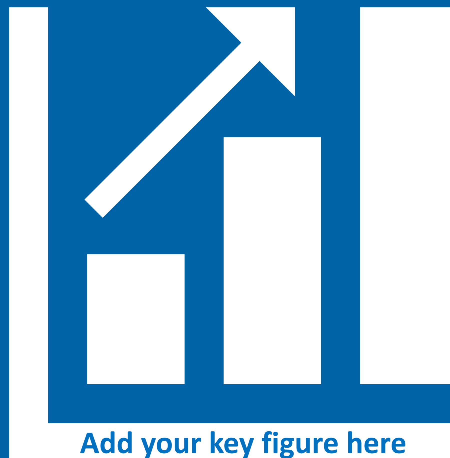
Figure caption: (Optional!) Can be helpful that people understand your main figure or message without you explaining it

Describe your main finding/result in one sentence to catch the attention